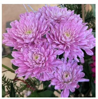
"Please convey my thanks for the beautiful flowers brought round last week I was touched to receive them together with the prayerful support I have received following my recent surgery."